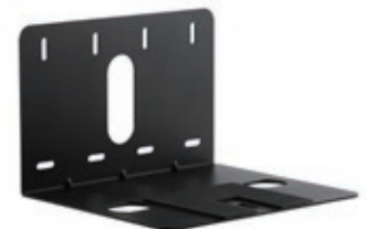
VC-AC03 Wall Mount

Lumens ™ Brilliance by Design www.MyLumens.com