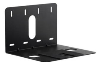
VC-AC03 Wall Mount

Lumens TM Brilliance by Design www.MyLumens.com