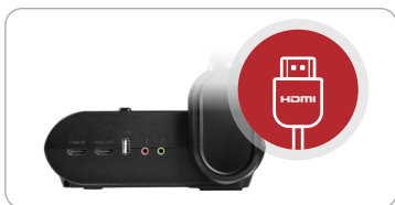
Image Streaming via HDMI Connectivity

Bend and adjust the gooseneck whatever you need to make the sample be seen crystal clear. Students will miss any details no more.