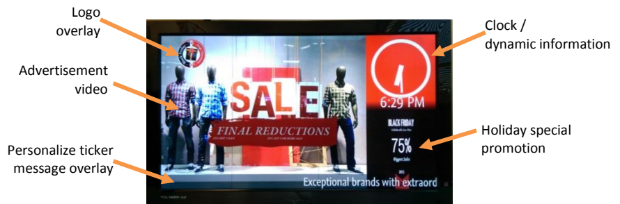
Retail advertisement demo (Monitor not included)